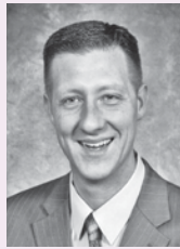
By: Darin Higgins WICU President

WICU members can take advantage of lower fixed interest rates on personal/unsecured loans, new/used vehicle loans, recreational vehicle loans, motorcycle